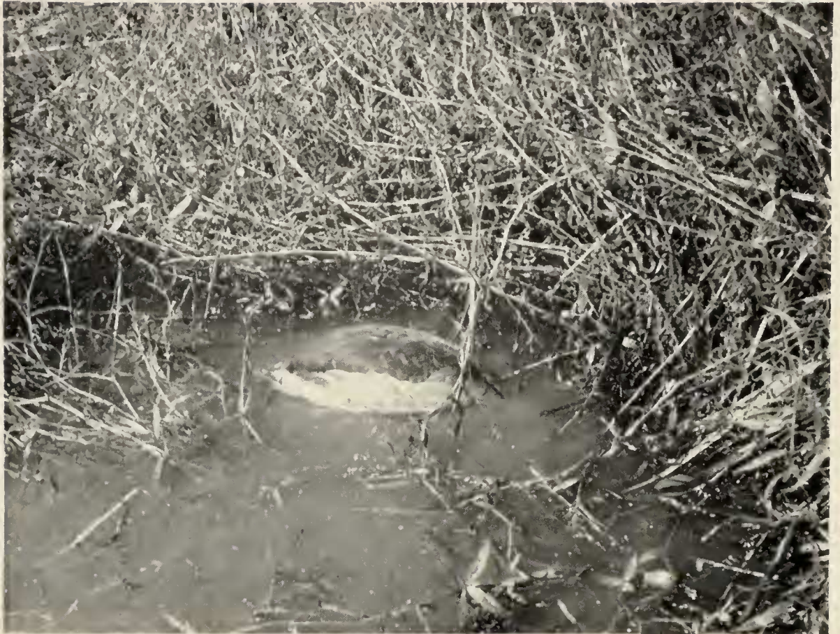
FIG. 7. A typical feeding posture of Fulvous Tree Duck.